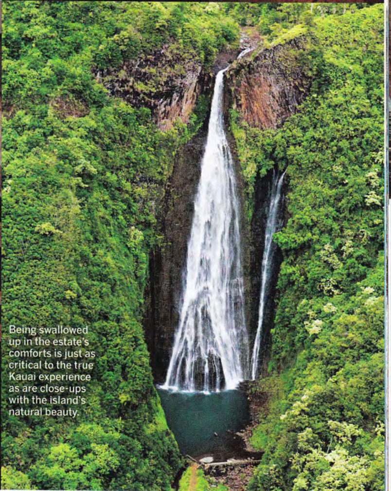
Being swallowed up in the estate's comforts is just as critical to the true Kauai experience as are close-ups with the island's natural beauty.